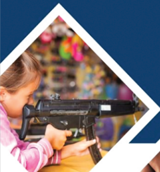
SHOOTING RANGE GAME