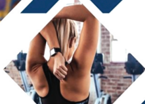
HEALTH CLUB (GYM)